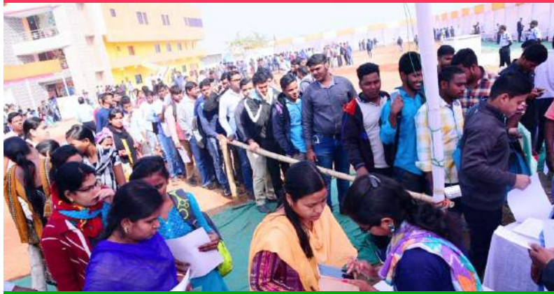
Job Fair Odisha 2018