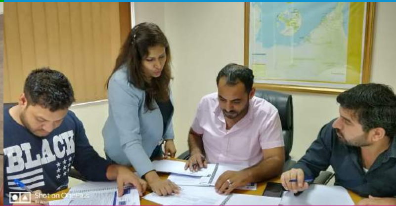
RPL ToT organized for XtraMix, Abu Dhabi, UAE 2019