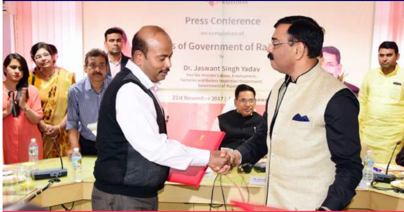
MoU signing with RSLDC 2016