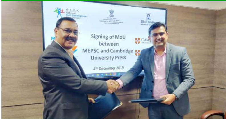
MoU signing with Cambridge University Press 2019