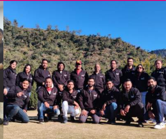
Team Outbound Training, Dehradun