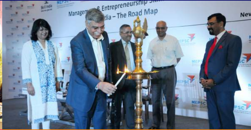
MEPSC Skills Summit 2017