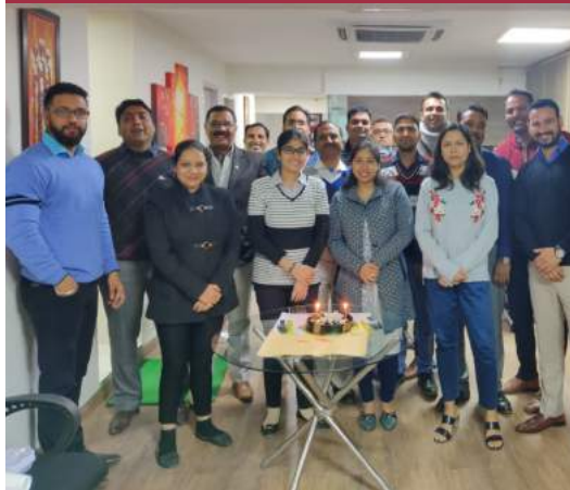
MEPSC 4th Foundation Day Celebrations