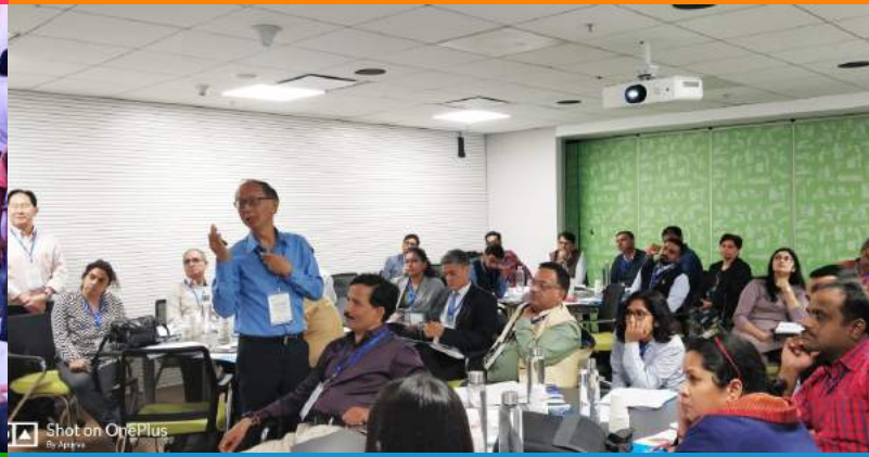
Training (ToMT/ToMA) with Singapore Polytechnic 2019